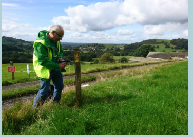
Social Groups Our 'Talk and Games' group meet every Thursday afternoon and take regular trips out to local attractions