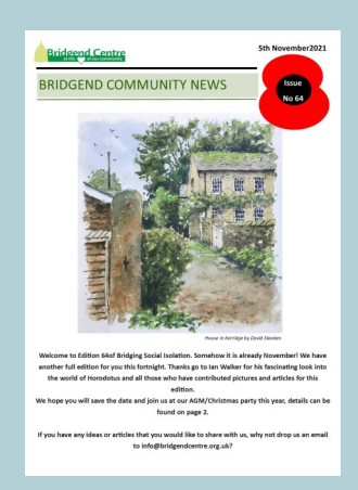
47 editions of 'Bridging Social Isolation' were produced and reached approximately 500 people every edition

39 People accessed community support for personal crisis or mental health problems