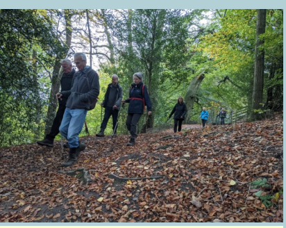
117 different people went on 37 Bridgend walks