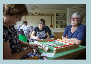
Activities A wide range of sessions including Art, Craft, Bridge, Mah Jong, Choir and Spanish